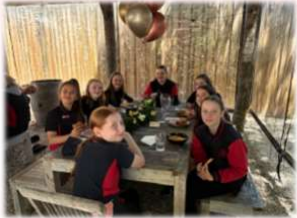
16/12/2025 - 'The 1860 Romsey'