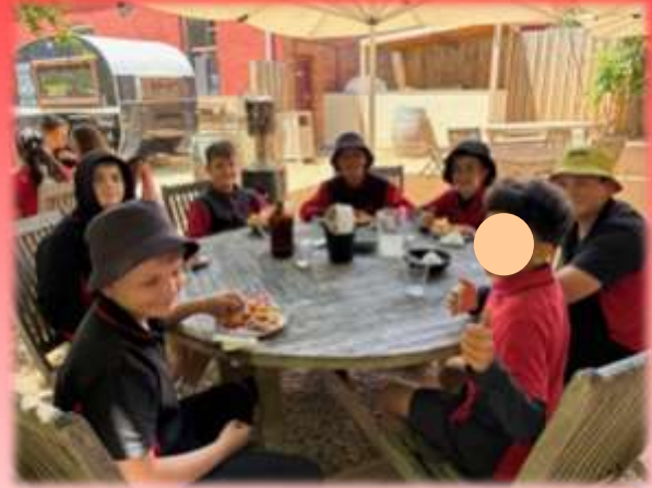
Year 6 Graduation Lunch